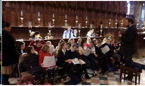
Rehearsal in the Cathedral