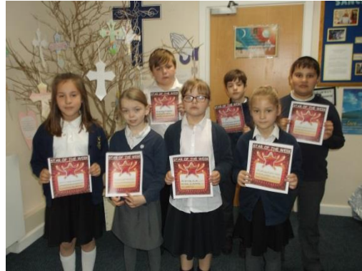
Stars of the Week