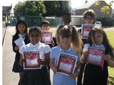
Stars of the Week